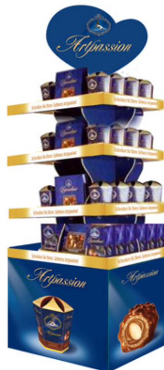
Artpassion product display stand