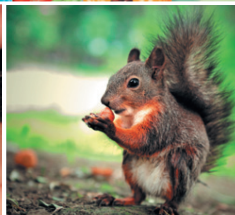
Forest Fairy – rich taste, natural product