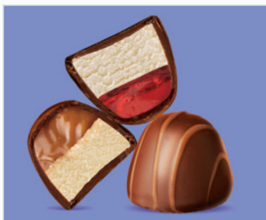
Bright & emotional