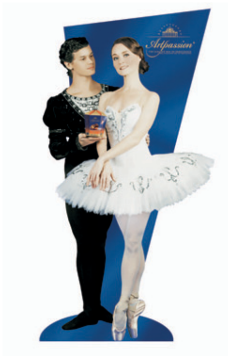
Artpassion life size promo stand up