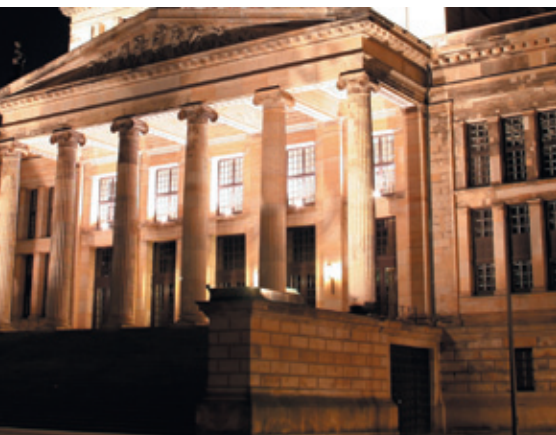
A symbol of elegant choice