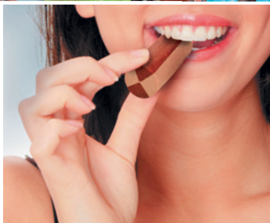
Bon Roll – unique recipe since 1959. Soft small roll from two spreads