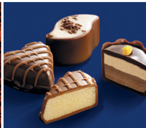
Collection of refined chocolates