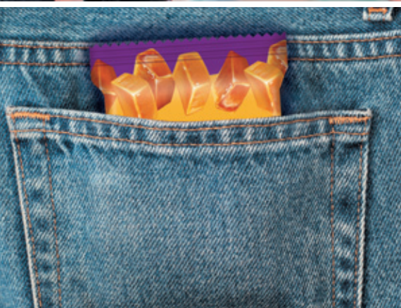
New format of mini-quadro-bar