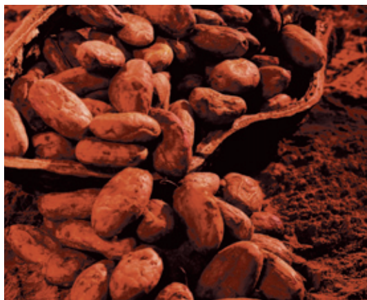
High quality cocoa beans from Cote d'Ivoire and Ghana