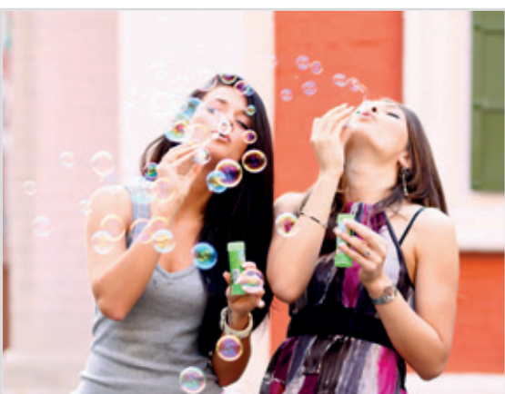
Moments to enjoy for every day!